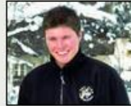
Brigade Fleece Jackets

Welcome > Your School's Page > Crew Neck Sweatshirt