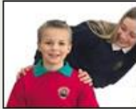
Crew Neck Sweatshirt